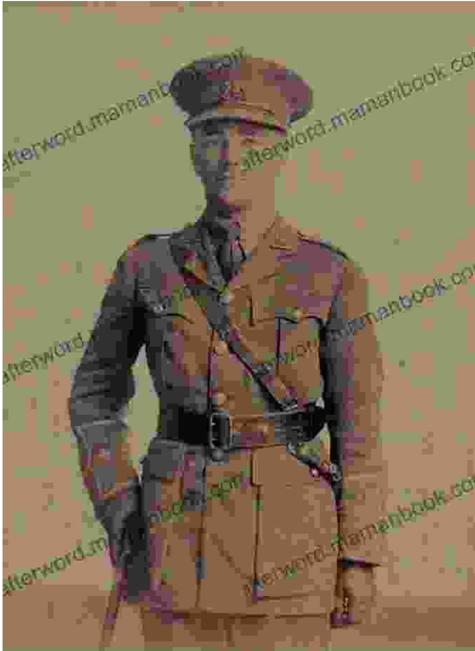
Wilfred Owen, the renowned war poet.